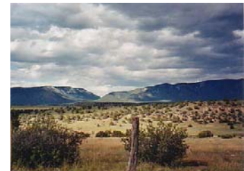
Near Check Point 4

From Capitan you continue east and then south to Ft.