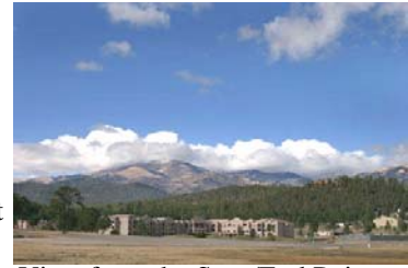
View from the Start/End Point

After check point 3, you will drop out of the evergreen forest into the Sonoran Desert and wind your way to Capitan, NM. Then you climb to the Capitan Gap where Smokey Bear was found.